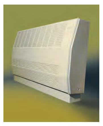
PSU Fan Convectors