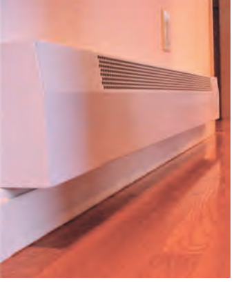
Heating Edge Perimeter Units