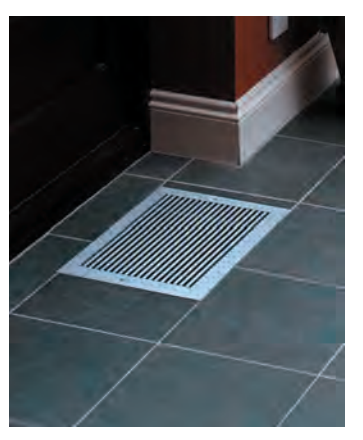
FL-100 In Floor Units