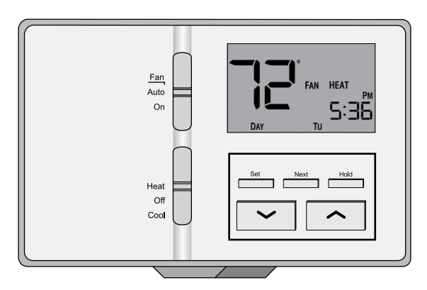
Figure 1 • TH-P721 Thermostat

To avoid electrical shock or damage to equipment, disconnect all power before installing or servicing.