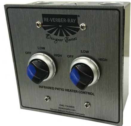
Figure 1 • TH-DSTS2 Controller

Dimensions: 4.75" W x 4.75" H x 2.625" D