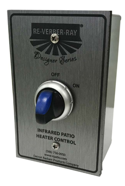
Figure 1 • TH-DSSS1 Controller