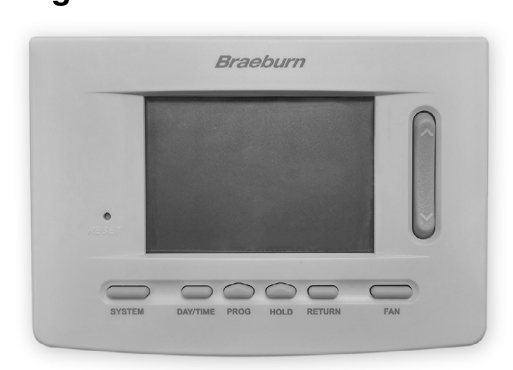
Figure 1 • TH-BR52 Thermostat

To avoid electrical shock or damage to equipment, disconnect all power before installing or servicing.