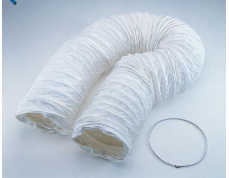
16" x 84" Section Polyvinyl flex duct with clamp