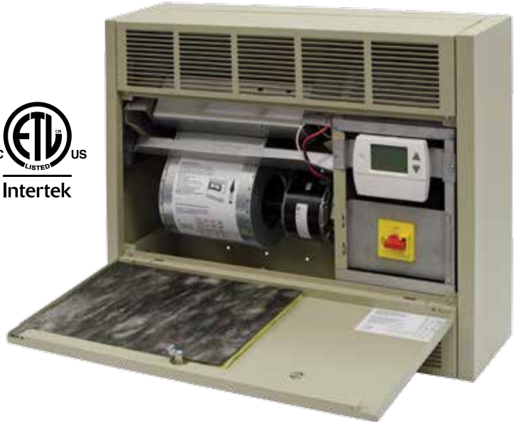
SD Setback Thermostat Option