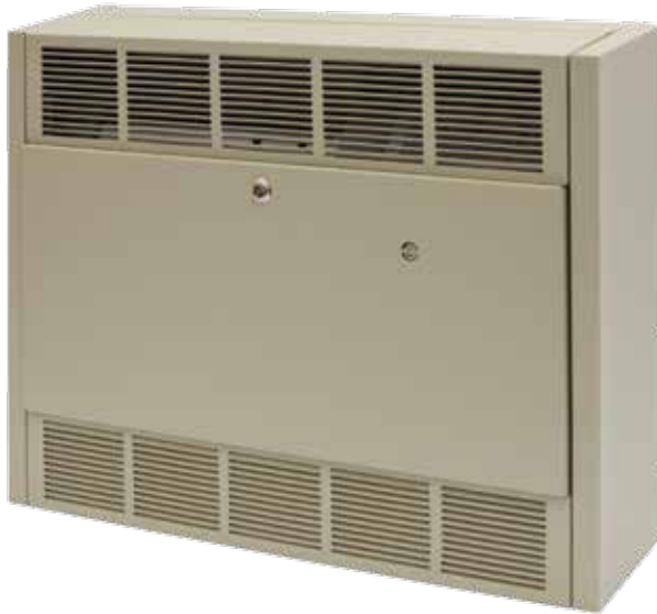
Locking Cover Option