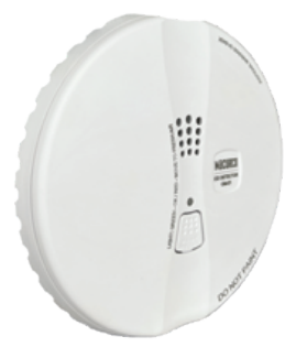
CM-E1 (Round housing flush mount)