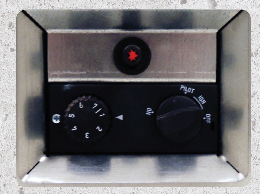
7-setting thermostatic controller