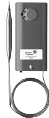
A19AAB Temperature Control