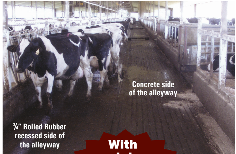
Concrete side of the alleyway