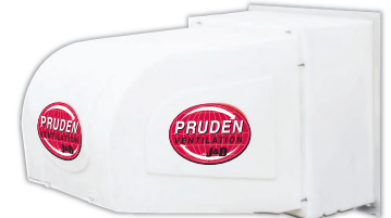
20" & 24" with Poly Weather Hood