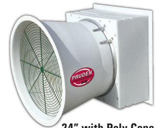
24" with Poly Cone