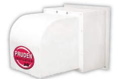
12" & 16" with Poly Weather Hood