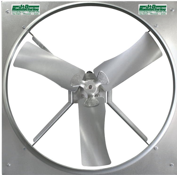
36" Direct Drive 3-Blade Panel Fan