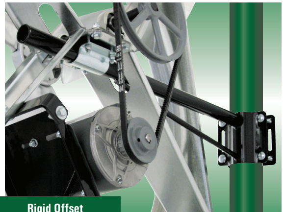
Rigid Offset Column Mount Bracket for Belt Drive Panel Fans