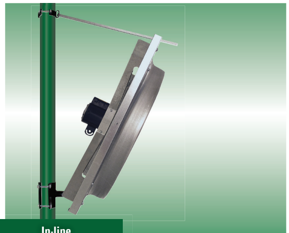
In-line Column Mount Bracket for Direct and Belt Drive models of Panel Fans

⚠ WARNING: This product can expose you to chemicals including lead, which is known to the State of California to cause cancer and birth defects or other reproductive harm. For more information go to www.P65Warnings.ca.gov/product .