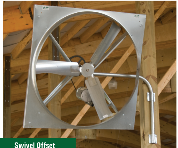
Swivel Offset Wood Post Mount for Belt Drive Panel Fans