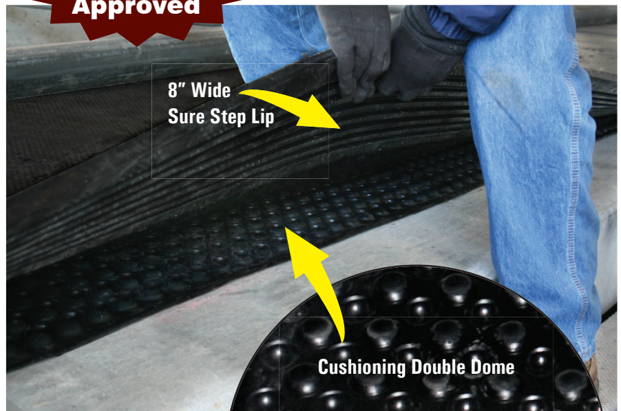
8" Wide Sure Step Lip