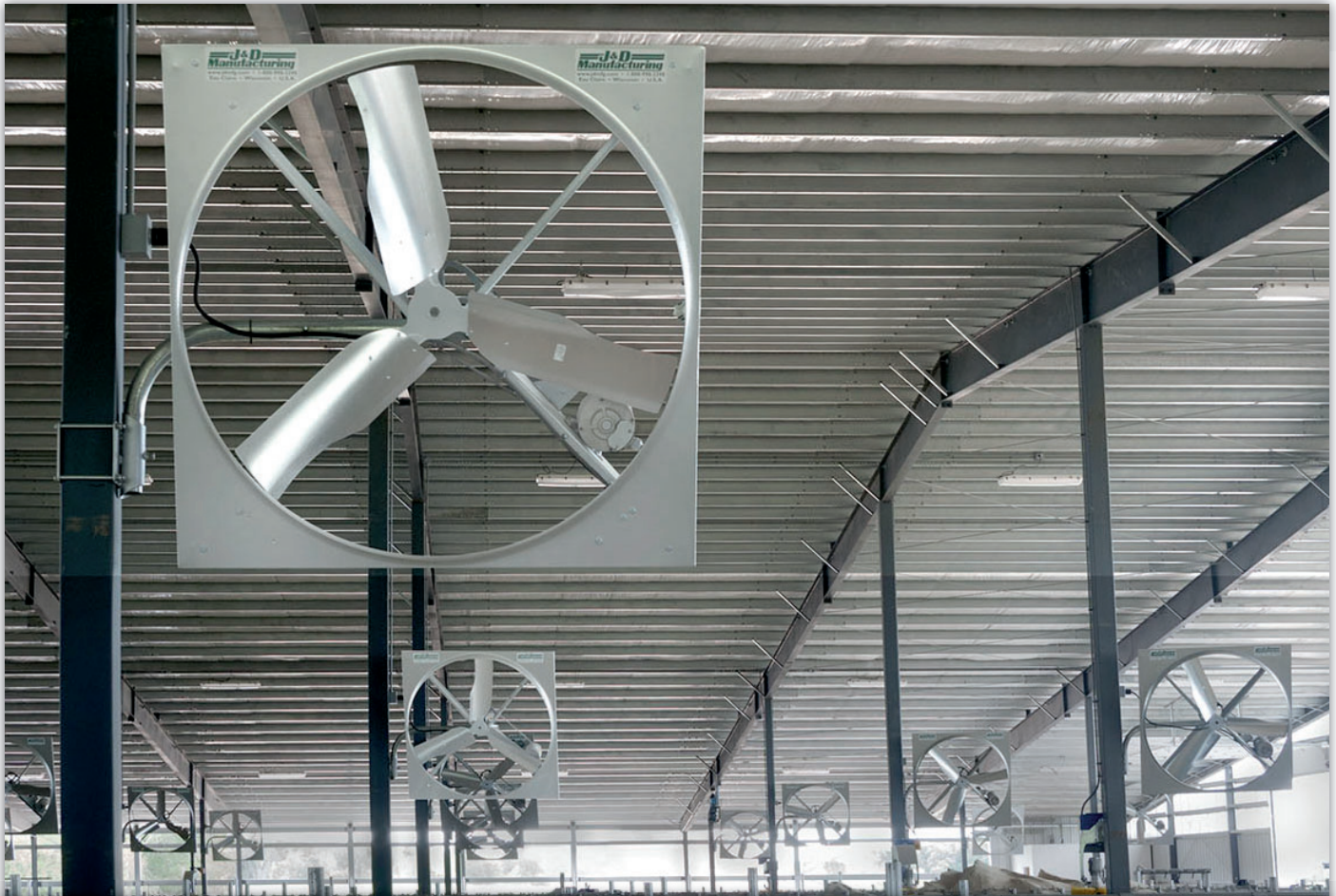
Belt Drive Panel Fans with Galvanized Prop and VRSBRSQ6X Swivel Offset 6" Square Column Mounting Brackets