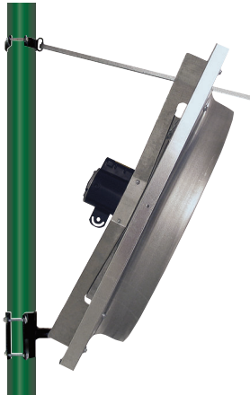
In-line Column Mount