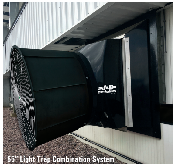
55" Light Trap Combination System