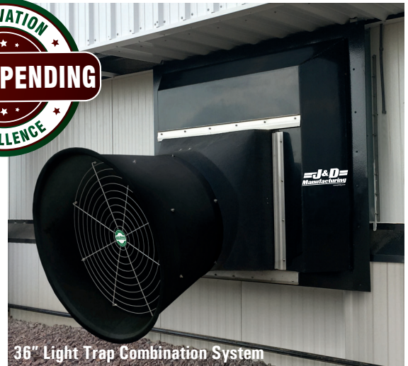
36" Light Trap Combination System