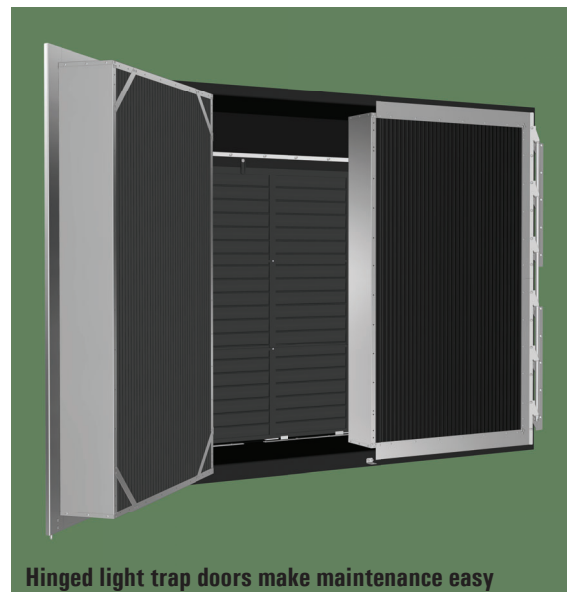
Hinged light trap doors make maintenance easy

⚠️WARNING: This product can expose you to chemicals including chromium, which is known to the State of California to cause cancer and birth defects or other reproductive harm. For more information go to www.P65Warnings.ca.gov/product .