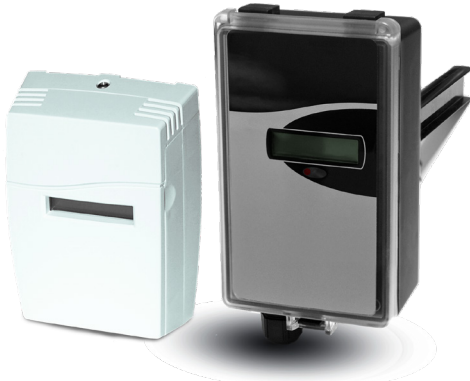
Sensors sold separately

Connecting the CO 2 sensor to the over-ride terminals on our Fresh Air Ventilation panel activates the On Demand Ventilation function to provide fresh air into areas or rooms with high concentrations of CO 2 . Contact iO HVAC Controls for engineering and installation instructions and schematics.