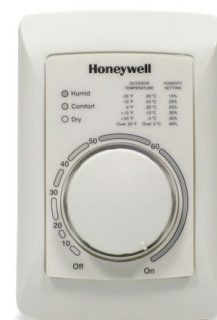
Humidistat H8908A SPST