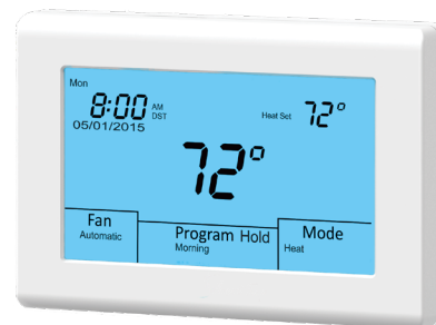
UT32 thermostat sold separately