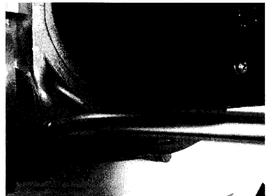
Figure 3 – Hose Connected to Blower