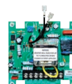
Circuit Board Assembly