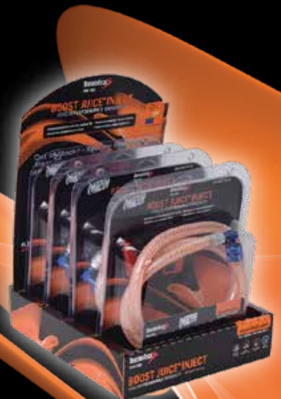
992 Available in 4 unit cases