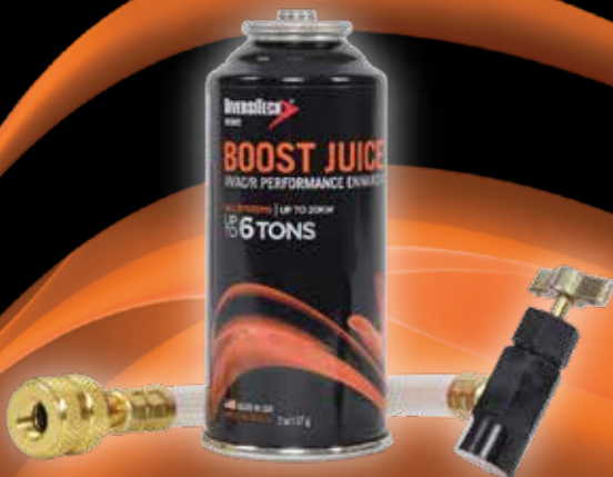
Part# 993KIT The Boost Juice Kit comes with one 2 ounce can and non-reusable hose