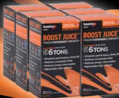
993KIT Available in 6 unit cases