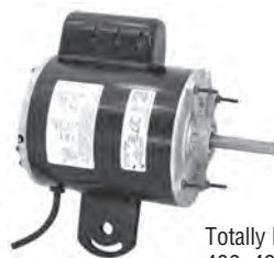
Totally Enclosed 486, 486A, 647A, 648A, 9451A, 9452A, Open D.P.: 914, 914L, 915L, 969A, 970A (Schaefer)