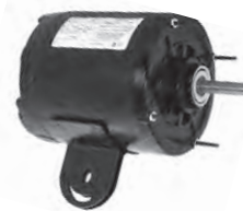
Totally Enclosed YA2020, YA2030, YA2054