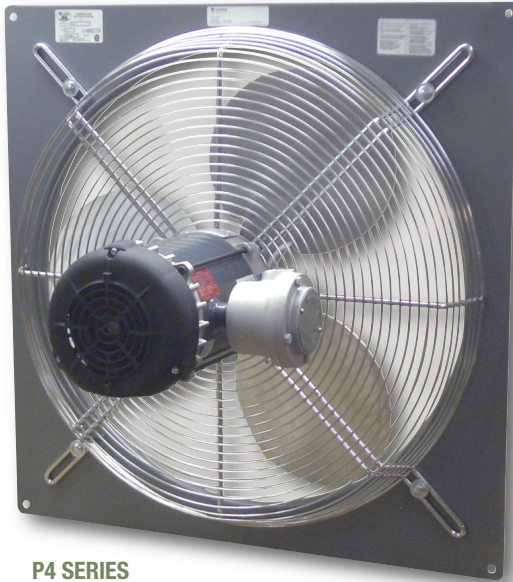
P4 SERIES EXPLOSION PROOF MOTOR