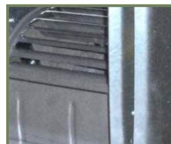
FORWARD CURVED BLOWERS OPERATE AT LOW RPM FOR LOW NOISE