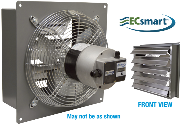
May not be as shown