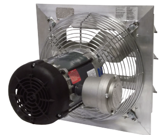
EXPLOSION PROOF MOTOR