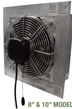
8" & 10" MODEL

The AX series exhaust fan is a sturdily constructed, direct drive, horizontal discharge fan that is typically used for general ventilation of factories, garages, warehouses and other industrial or commercial buildings. The AX fans are available in multiple single-speed variations as well as two-speed and variable speed models. The AX series housings are constructed of heavy duty aluminum with built in shutters that automatically open when the fan starts and gravity closes when the fan stops.