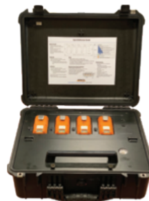
Bump/Cal Test Station